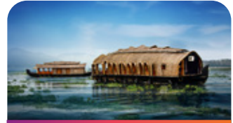
Houseboats in Alappuzha